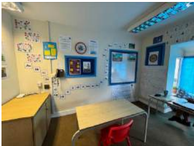
Speech and Language Room

We have a fully accessible building (via portable ramps) and an accessible toilet with changing table. The Hut hosts our Thrive, ELSA and Speech and Language department. It is also used for Personalised Provision, SEND meetings and assessments.