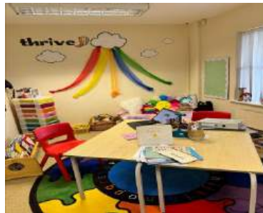
Thrive and ELSA Room