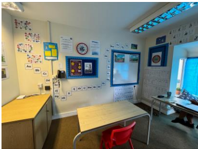
Speech and Language Room

We have a fully accessible building (via portable ramps) and an accessible toilet with changing table. The Hut hosts our Thrive, ELSA and Speech and Language department. It is also used for Personalised Provision, SEND meetings and assessments.