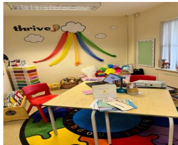
Thrive and ELSA Room